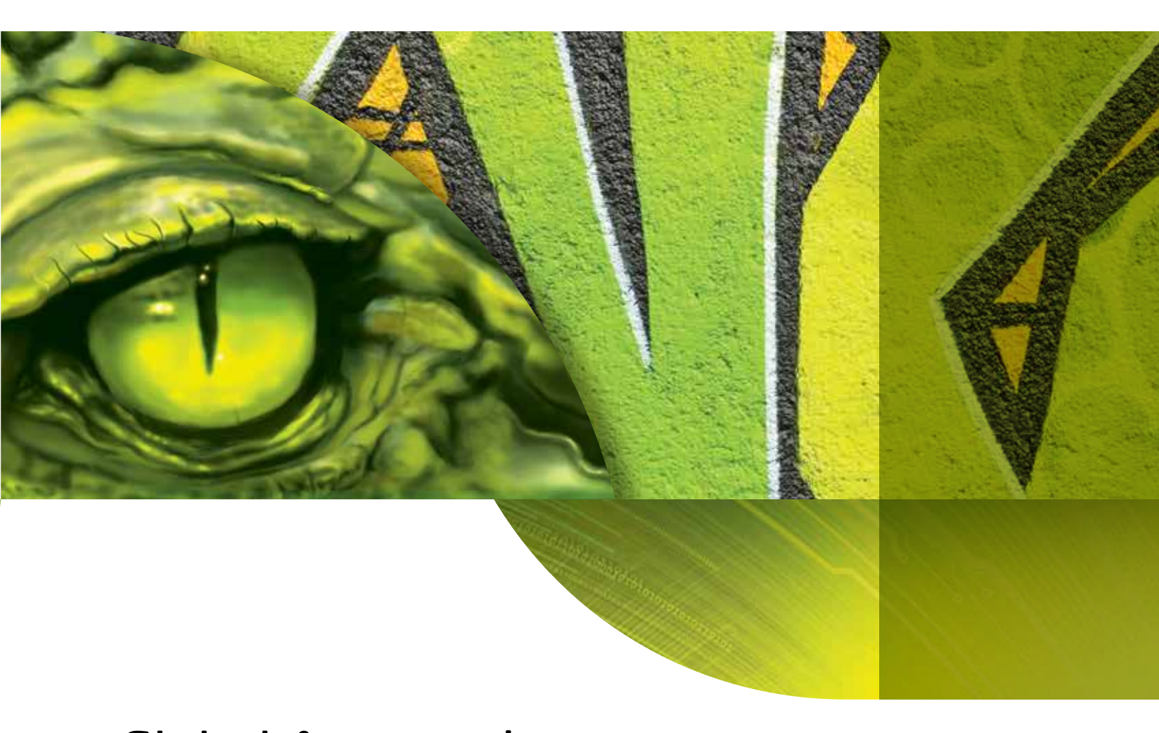
Global Automotive 2021 Color Popularity Report