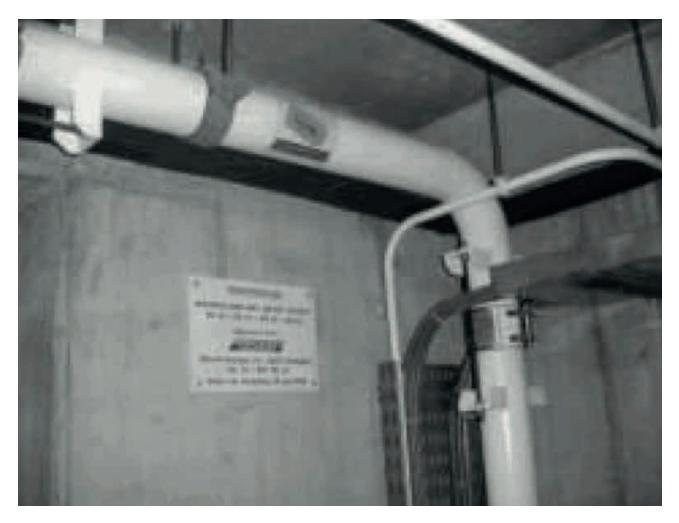
Figure 3. Abcite-coated piping after almost 20 years of use without any maintenance and in near-perfect condition.