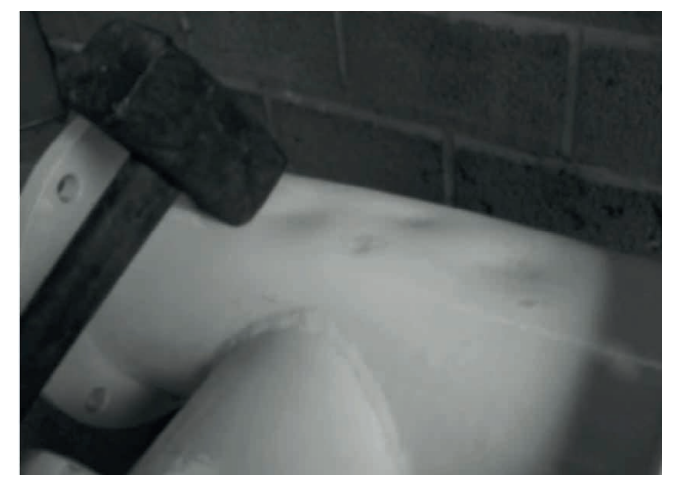
Figure 2. When hit with a hammer, the pipe will deform. The thermoplastic coating is able to adapt to the steel deformation, remaining undamaged and showing no failure or cracks.

I. HAYS, George F., 'Now is the Time', PE Director General, World Corrosion Organisation, http://corrosion.org/wco_media/nowisthetime.pdf