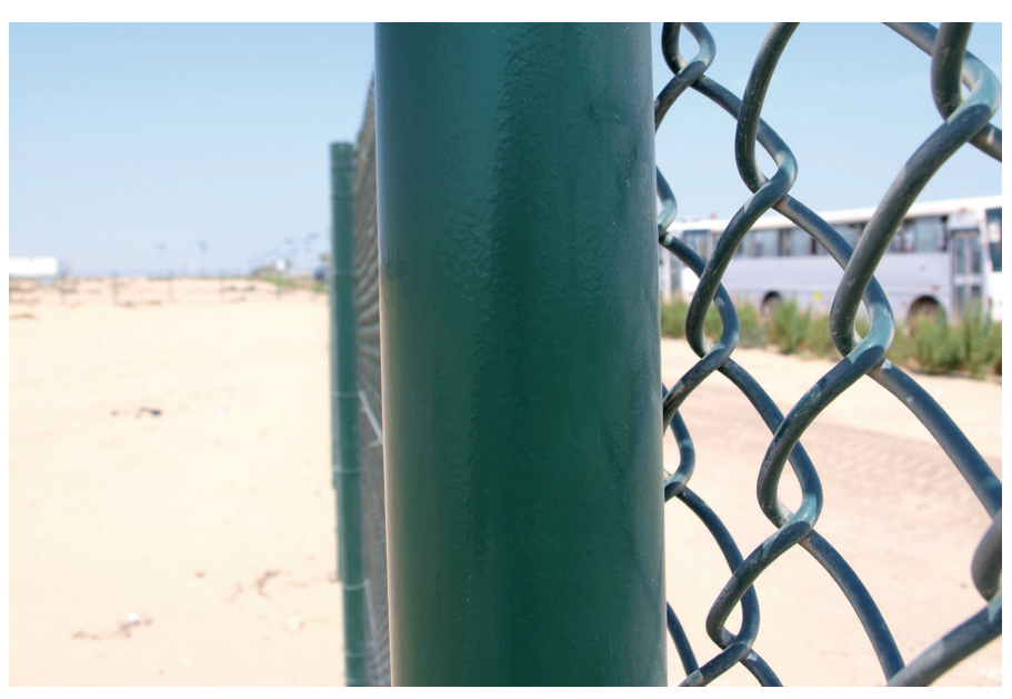
In 2015, after fifteen years exposure to wind blown sand and high UV levels, Plascoat PPA 571 is still protecting the fence from corrosion.