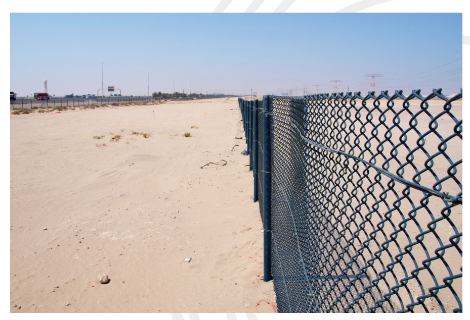
Completed in 2000, the fence stretches for many miles over the horizon. It is therefore vital that maintenance is kept to a minimum.

In 2015, fifteen years after installation, this fence is still protecting the pipeline and shows no sign of corrosion.