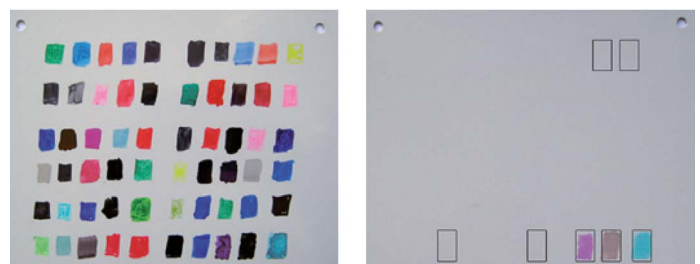
60 colours tested BEFORE cleaning