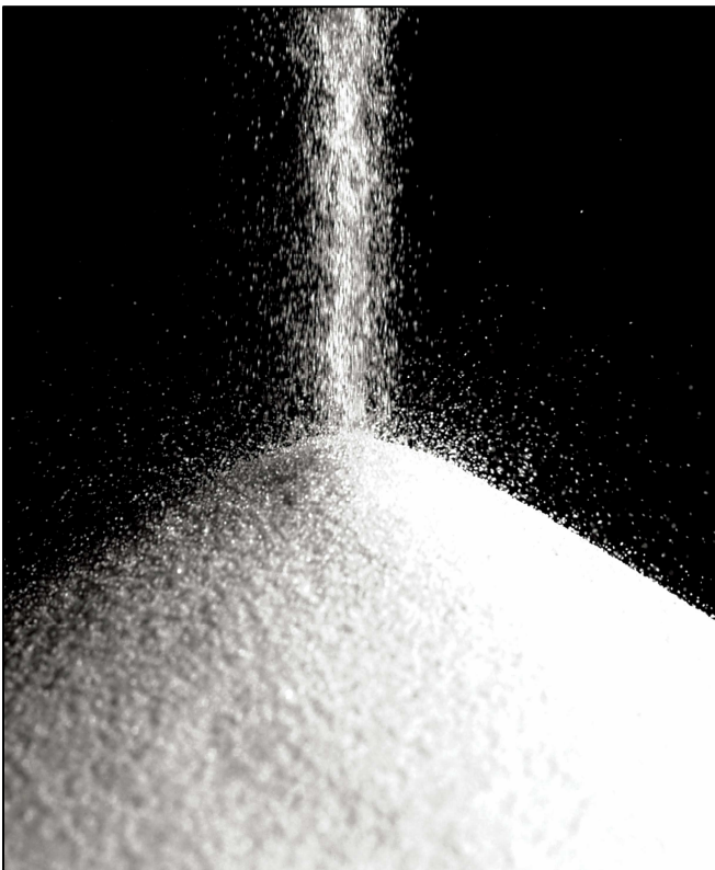
Coathylene ® - fine thermoplastic powders used as dispersion agents in masterbatches

To produce uniformly colored plastic items, it is necessary to homogeneously disperse pigment within a polymeric matrix. This process consists of compounding the polymeric matrix with a Masterbatch.