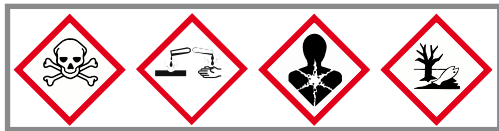
Sample Voltatex® 7340 AX