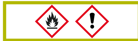
Sample Voltatex® 7345 A ECO