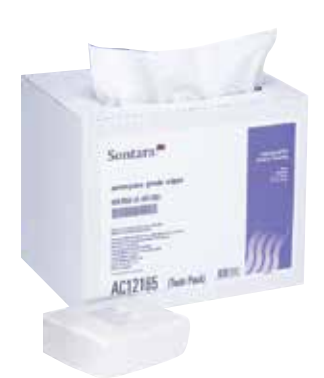
Aerospace grade wipes, 30cm x 42cm, 250 wipes per box (Code: AC12165)