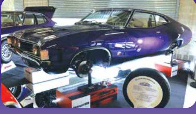
Having a perfect colour match for these iconic Australian muscle cars is a must for Steve who says that's a big reason why he loves the Spies Hecker system. "When I mix up a colour and check it against the original, it actually looks perfect, the way it came out of the factory."

The XW GT is a case in point. It's finished in a Ford factory colour called 'Brambles Red' which is extremely sought after because many of the Bathurst race cars wore it in the 1970s.