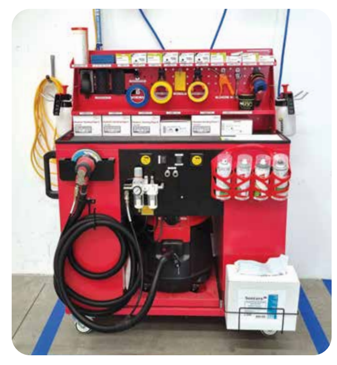
Above: Example of a point-of-use cart.

5S is a methodology for establishing a visual workplace that uses 5 steps: Sort, Shine, Set in Order, Standardise and Sustain - to help employees achieve their tasks in the most efficient, effective and safest way. Through workplace organisation, not only do processes become streamlined and standardised, but productivity increases and waste reduces, ultimately strengthening business performance.