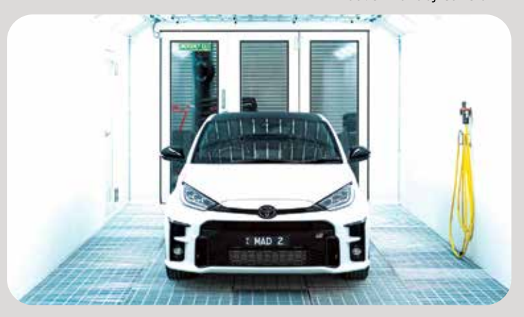
Above: 9.5m Alfa Elite paint booth.