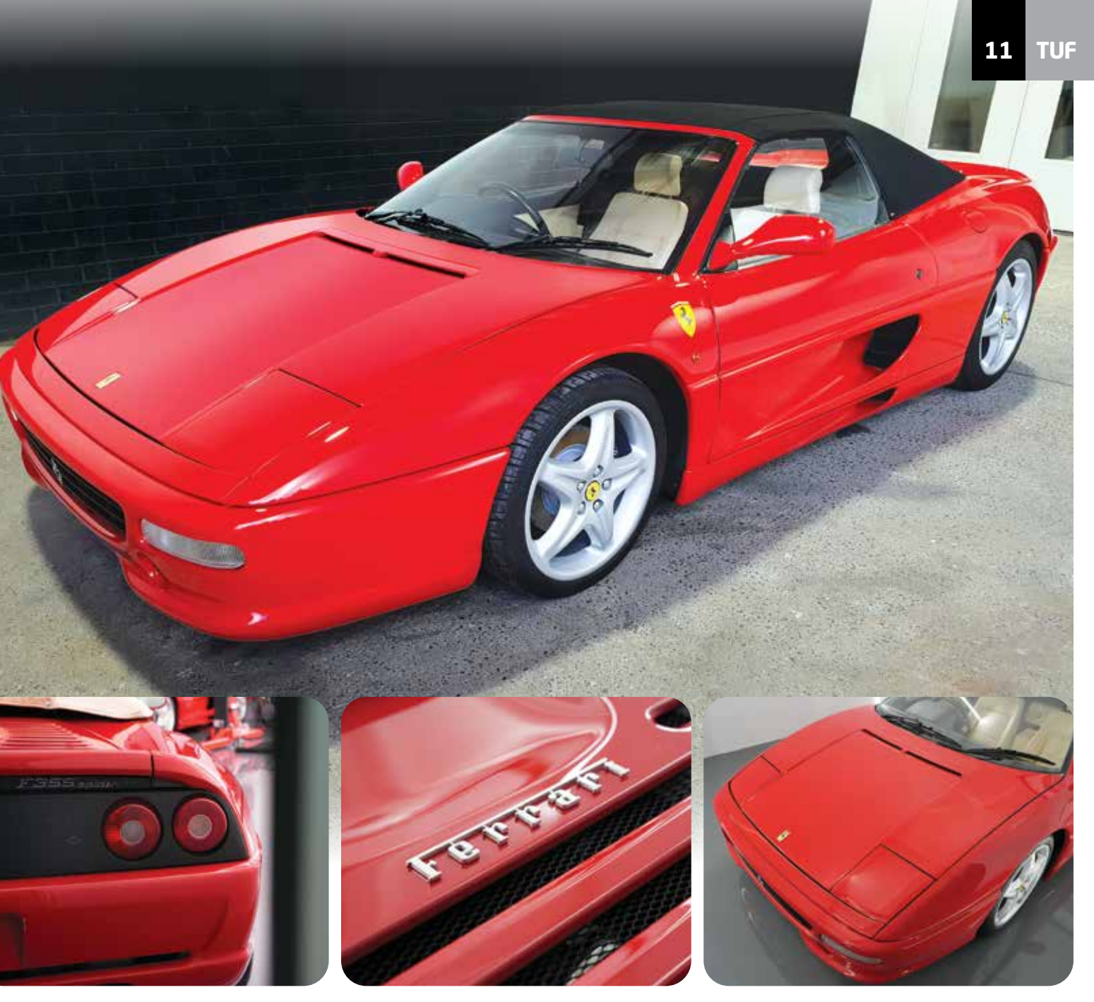
Above: Award winning restoration of the 355 Ferrari.