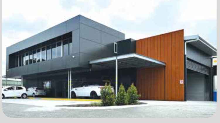
Above: Front of Collision 1.