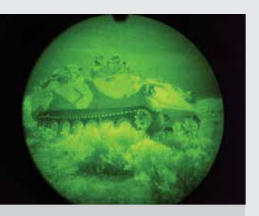
NIRR coatings are designed to reduce detection by sophisticated NIR technologies

With a united global team, Axalta can provide end-to-end coating project management solutions worldwide. From developing customised product solutions and special applications techniques, to extensive on-site training and technical support, we support our military coatings customers anywhere in the world.