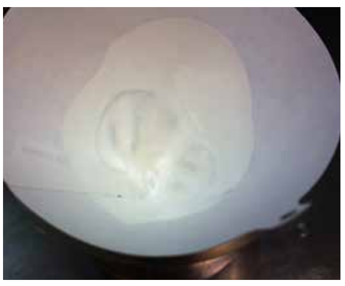
An example of properly stirred paint

Compare the images of stirred and unstirred paint to see what can happen if this critical step is ignored. Where the paint has been stirred correctly, the colour appears properly reproduced. However, where the paint was not stirred as recommended, black pigment has separated out and is caught in the filter.