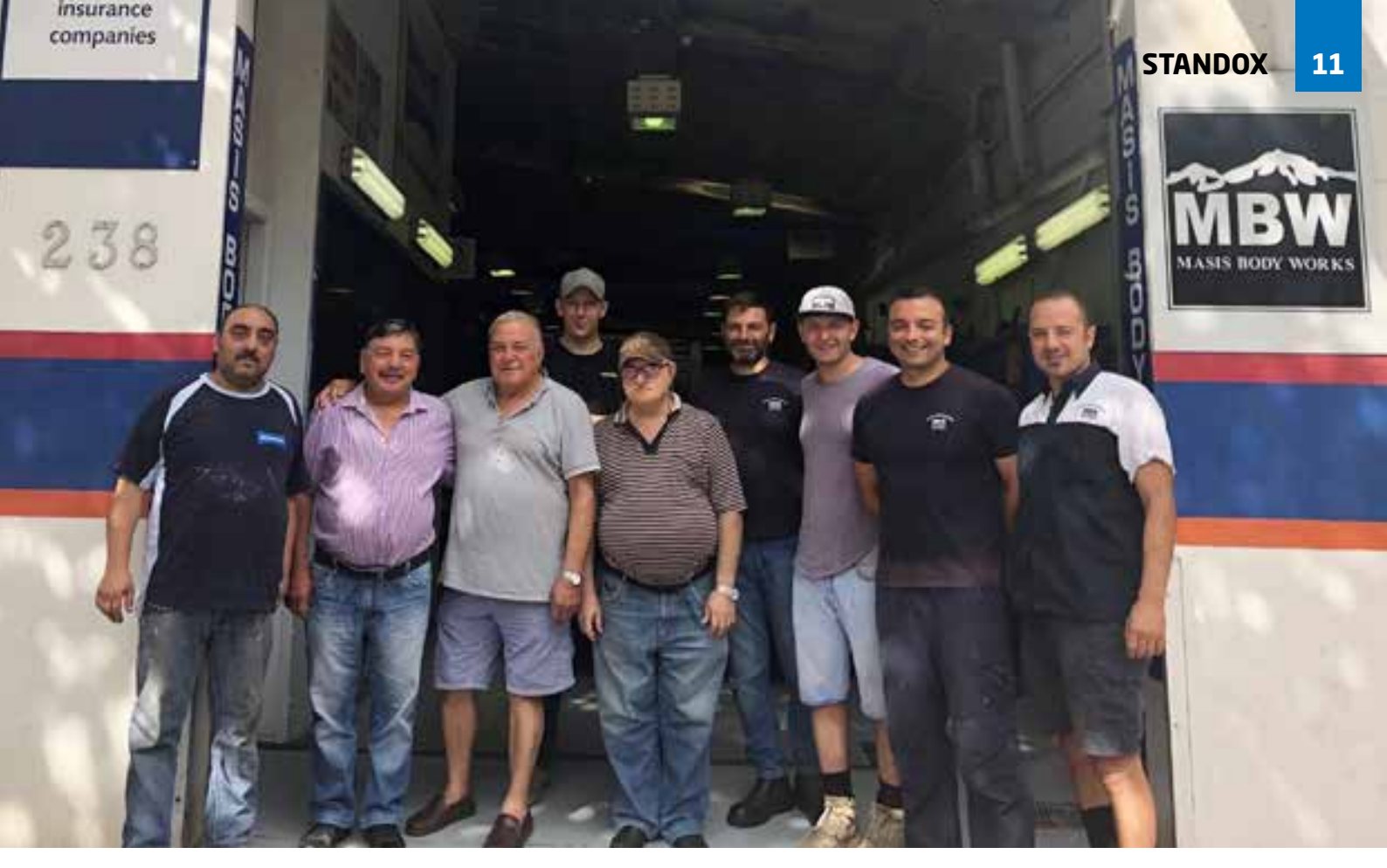
The team at Masis Bodyworks