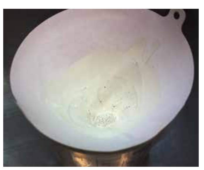
An example of improperly stirred paint – the black pigment has separated and caught in the filter