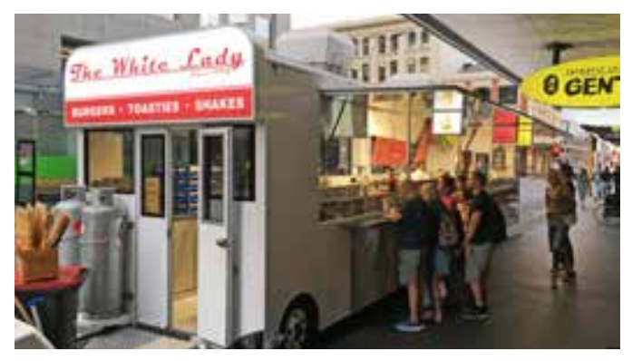
The White Lady is one of the longest running mobile food businesses

"The family are loving it. They were using caustic cleaner to remove the graffiti and now they just need liquid detergent and a bucket of water to wash it off."