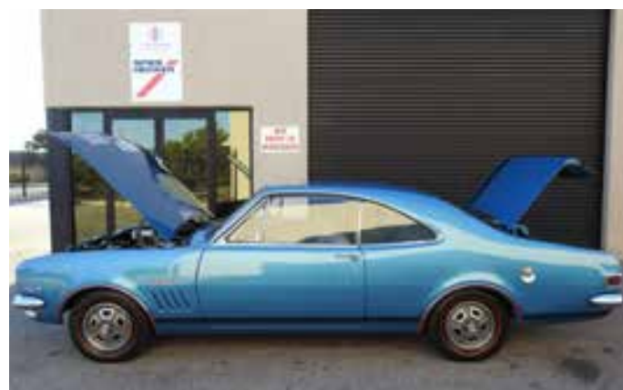
The HK Monaro is painted in Bright Metallic Blue

"I started using Spies Hecker in the 1980s when I was restoring cars. Even now, those customers tell me the paint and the finish on their cars is still the same."