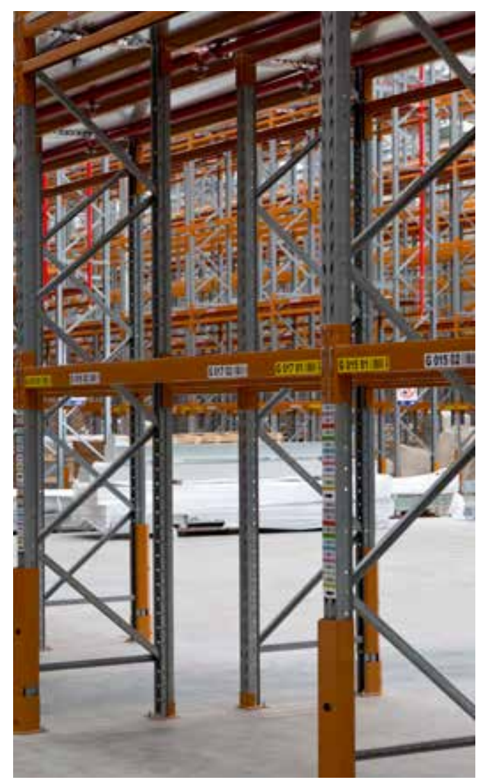
The warehouse has 3,450 square metres of capacity