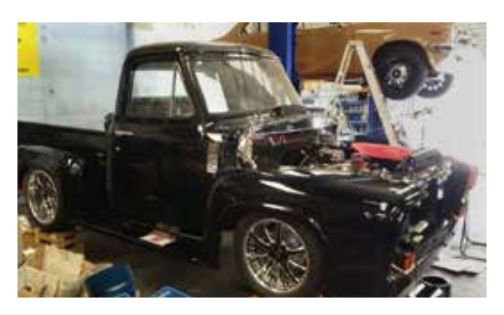
Restoration work is progressing rapidly

"When we tell a customer that a repair will take five days, we make sure we can get it back to them in five days."