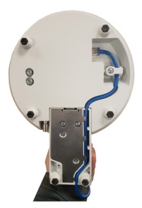
Cable Routing Under Scale